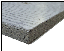
Square Edge Profile